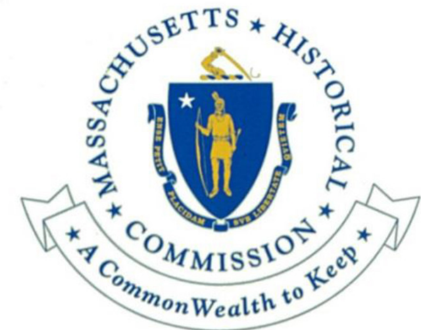
WILLIAM FRANCIS GALVIN SECRETARY OF THE COMMONWEALTH CHAIRMAN, MASSACHUSETTS HISTORICAL COMMISSION

The intent of the process is to prevent unnecessary demolitions and allow for the review of new construction and alterations visible from a public way within the district.